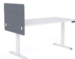
E-panel Side Screen Marl Grey with White brackets