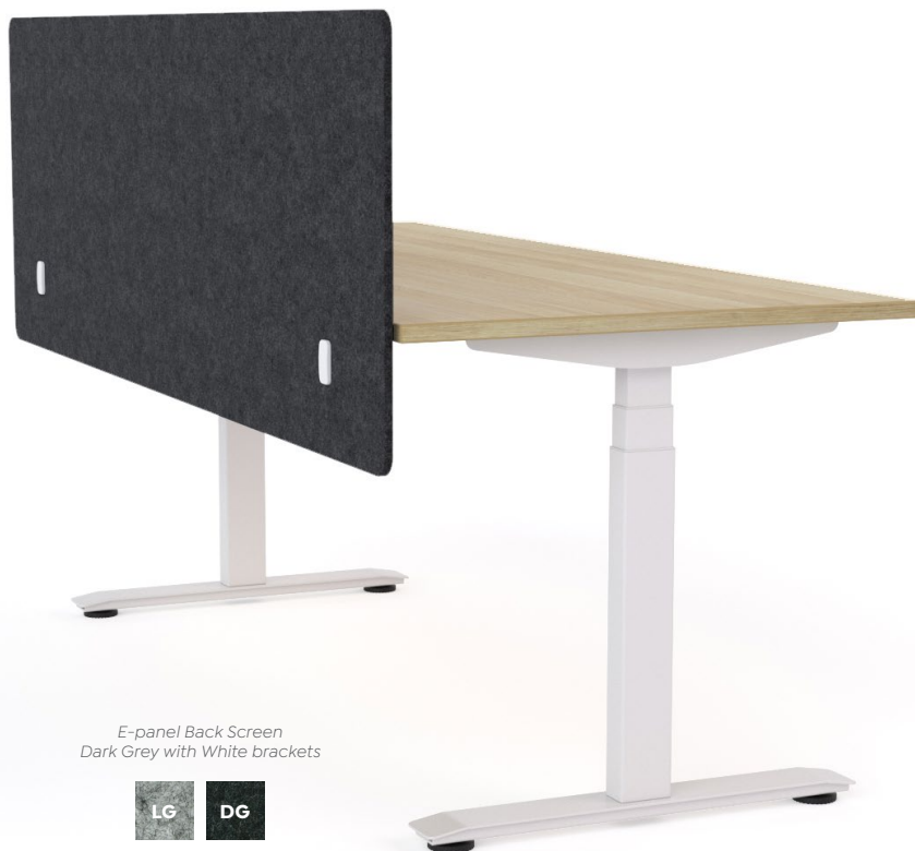
E-panel Back Screen Dark Grey with White brackets