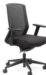
Motion Sync Optional Arms