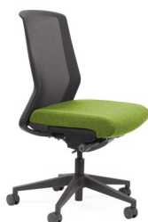
Motion Sync Motion Felt Seat Cover