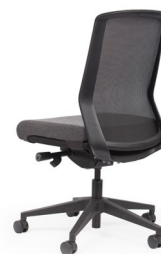
Motion Sync Reverse View