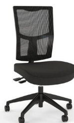
Urban Mesh Nylon Base