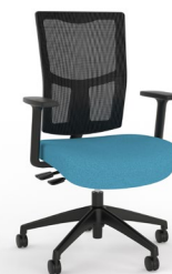
Urban Mesh Optional Arms