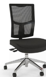
Urban Mesh Alloy Base